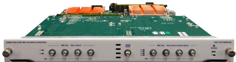
Figure 1: MX2 test module for 802.11 a/b/g/n/ac WLAN Wave-2 and DFS radar signal emulation.

The MX2 WLAN DFS test module offers the highest performance and consists of multiple IEEE 802.11 radios. It provides the maximum user configurability and flexibility to emulate various IEEE 802.11 a/b/g/n/ac clients on 2.4GHz and 5GHz and IEEE 802.11ac Wave-2 MU-MIMO clients on 5GHz band. A single WLAN radio supports 802.11ac Wave-2 clients with different spatial streams for the best realistic client emulation scenarios in either SU-MIMO or MU-MIMO. Designed for testing WLAN network infrastructure devices, including carrier or enterprise thin APs with controllers, consumer APs, and integrated broadband WLAN gateway, Spirent TestCenter WLAN solutions offer the best in class traffic generation and analysis for testing functionality, performance, and scalability.