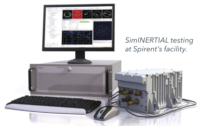
SimINERTIAL testing at Spirent's facility.

Spirent's SimINERTIAL architecture is also available in configurations to support transfer alignment and multiple sensor architectures.