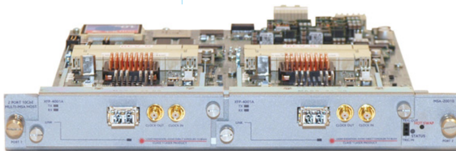
Multiple MSA-2001B test module with two 10GbE XFP-4001A Personality Boards

Two high density 10GbE test modules are offered for Spirent TestCenter. The modules are the entry-level MSA-1001A and the high performance and scalable MSA-2001B. The Series 1000 and 2000 offer functional, performance, system and conformance test capability.