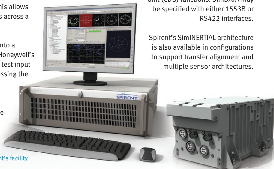
SimINERTIAL testing at Spirent's facility

Spirent's SimINERTIAL architecture is also available in configurations to support transfer alignment and multiple sensor architectures.