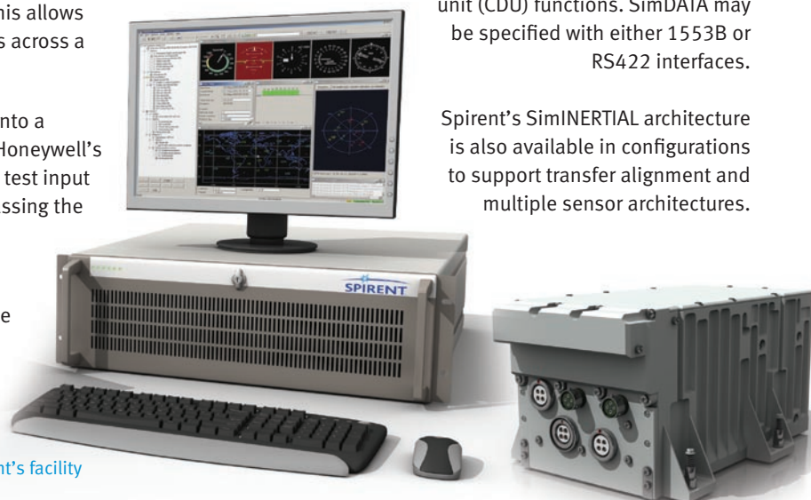
SimINERTIAL testing at Spirent's facility

Spirent's SimINERTIAL architecture is also available in configurations to support transfer alignment and multiple sensor architectures.